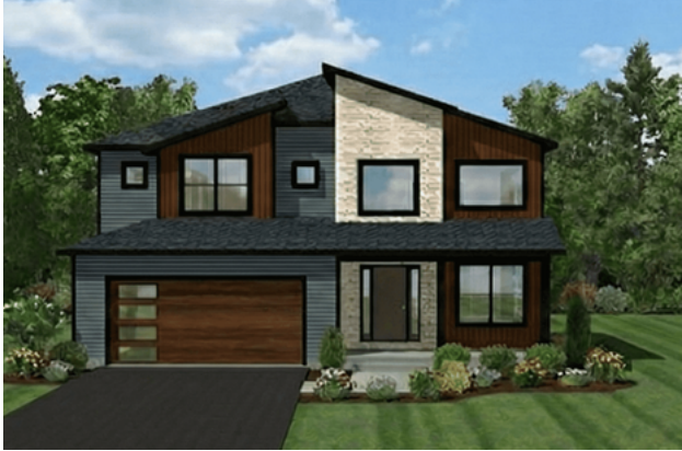
Optional Modern Elevation