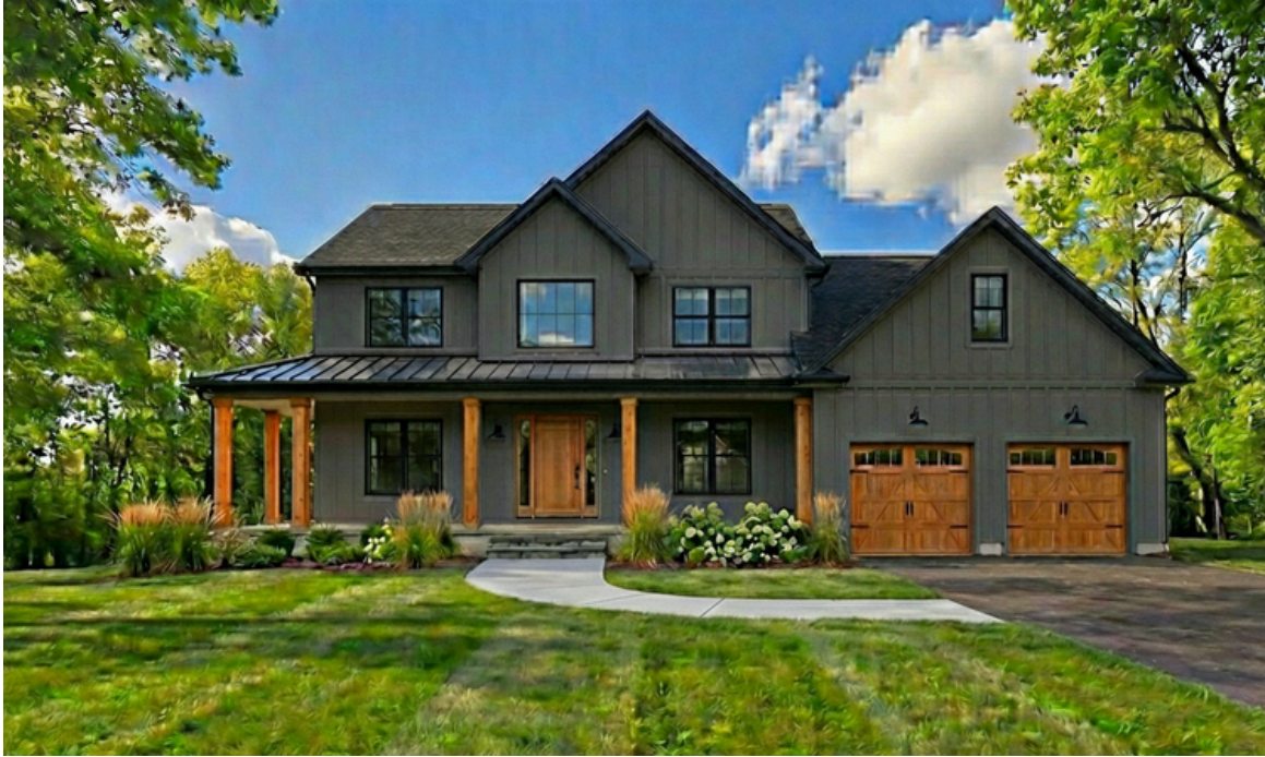
Modern Farm House Elevation